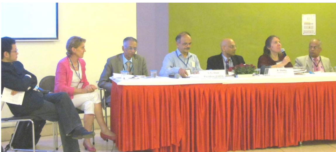
The Panel Discussion Session