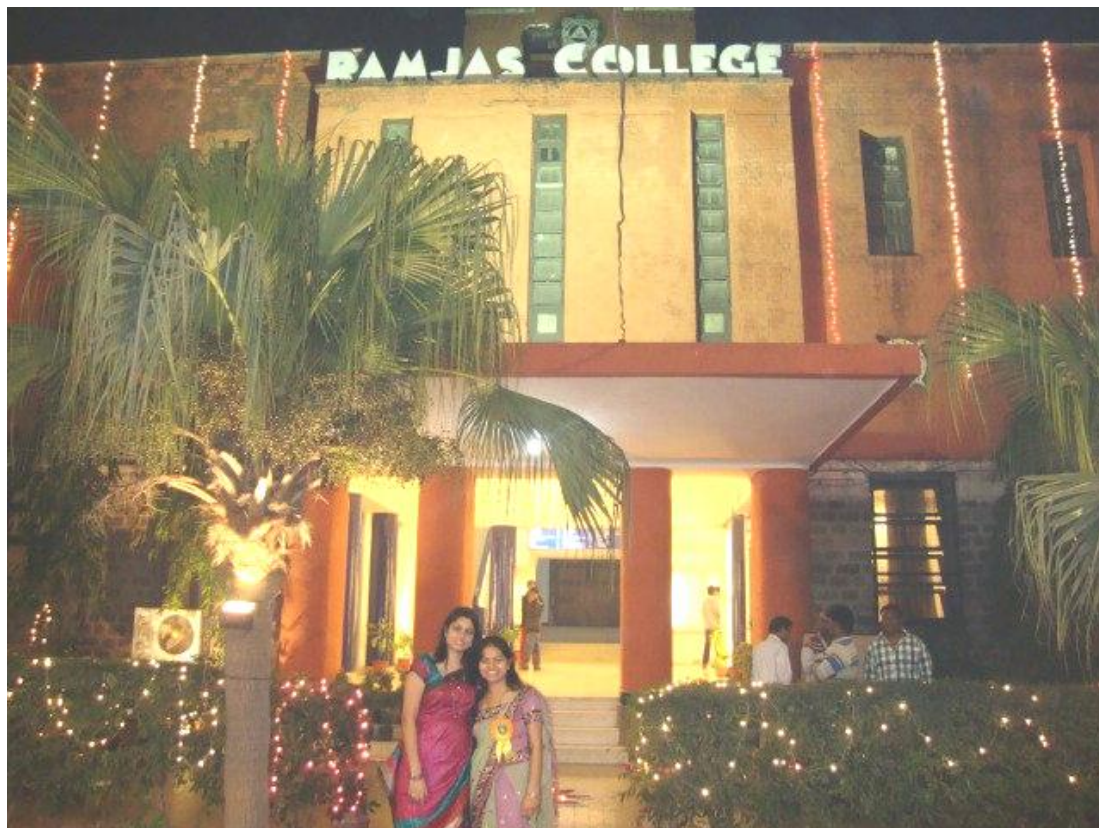
illuminated College Building

The delegates enjoyed a pre-dinner cultural programme by students and invited artists.. The