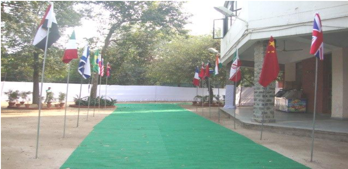
The Venue of the Seminar

A two-day International Seminar on History of Mathematics was organized by Ramjas College, University of Delhi recently. It was organized jointly with the Indian Society for History of Mathematics (ISHM) and Co-sponsored by the International Commission on the History of Mathematics (ICHM). The event focused on celebrating the National Mathematical Year to commemorate the 125 th Birth Year of Genius Srinivasa Ramanujan. It covered all aspects of the history of mathematics, and in particular, the ancient Indian history of the subject. A large number of mathematicians participated in the deliberations, including leading experts from 16 countries including USA, U.K., France, Italy, Israel, Iran, Brazil Japan, China, Egypt, Denmark, South Africa and Nepal, apart from many eminent scholars from India. The venue of the conference was Ramjas College, University of Delhi.