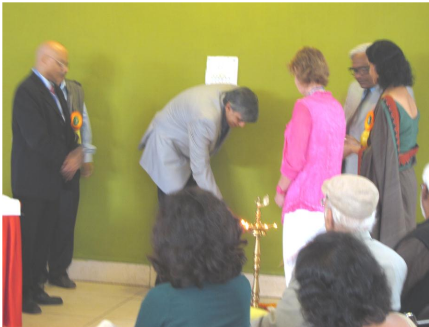
Lightening of Lamp