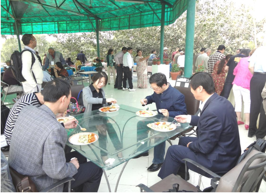
Delegates enjoying Lunch at the Tererace

Organizers deserve all praise for so successfully arranging such a large scale International Seminar on history of Mathematics in India at a time when things seemed difficult in view of the prevailing tense international scenario.