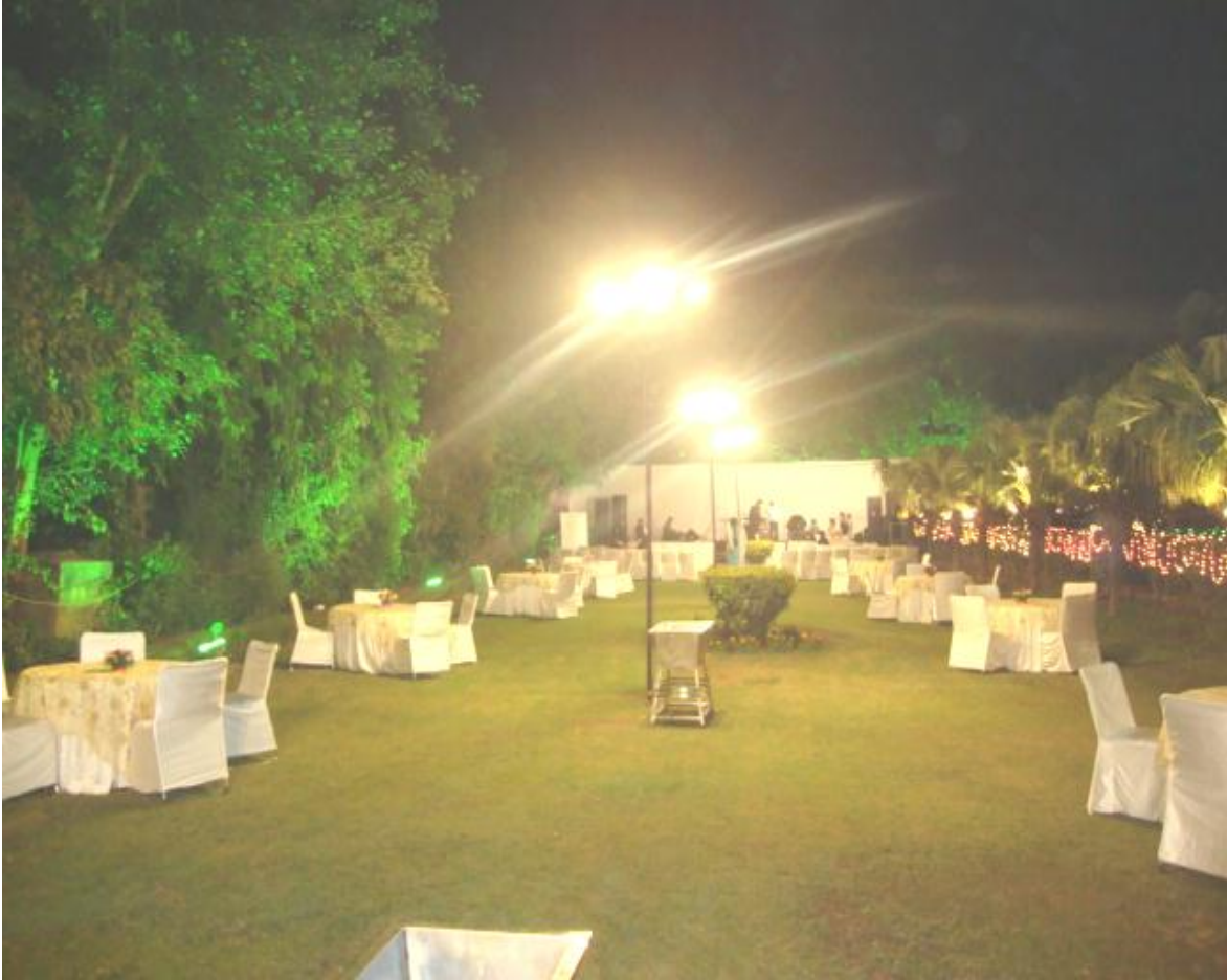
The illuminated Dinner Venue