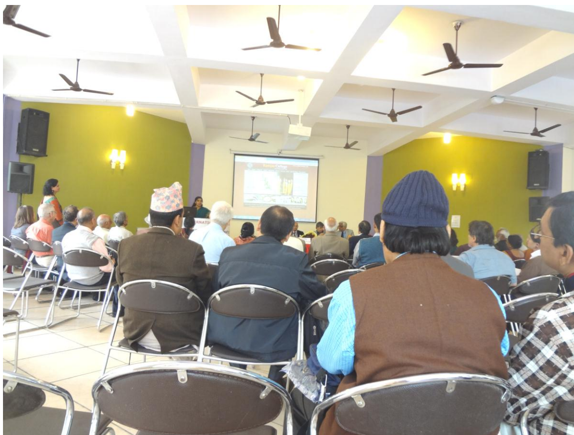
A Session in Progress

Summaries of all talks and papers, along with the CV and photo of each author, were available in the 132 page 4-color Souvenir that was released on the occasion. It contained useful information about the host city of Delhi, articles on its history, culture and seats of learning besides some articles on the history of mathematics. It also contained the information about the organizing institutes and the names and addresses of the participants.