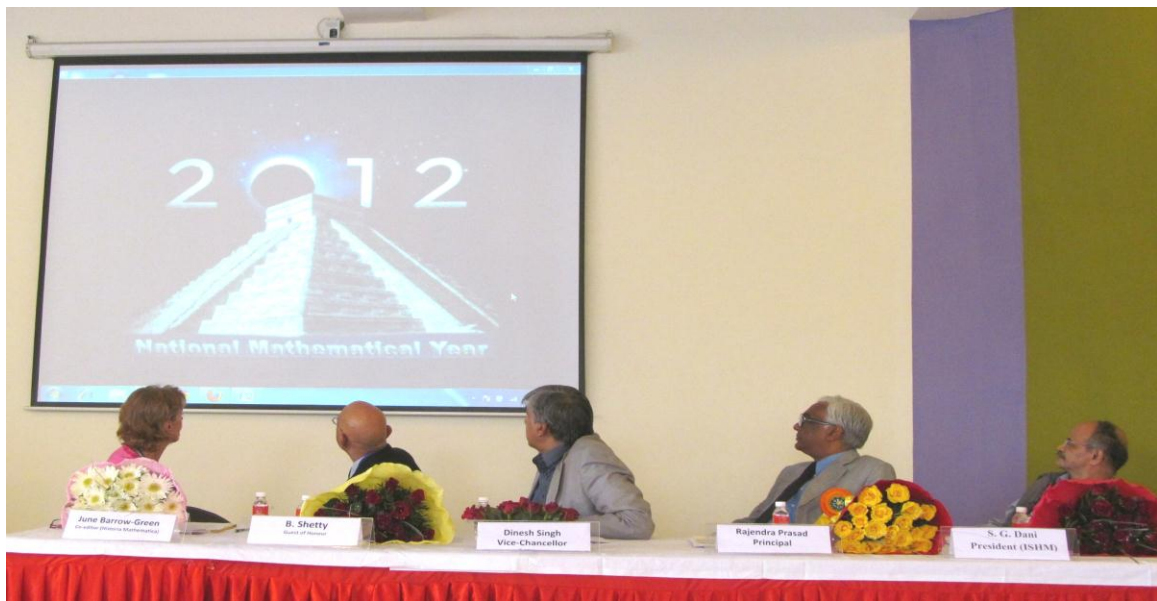
All watching a video clipping on Ramanujan